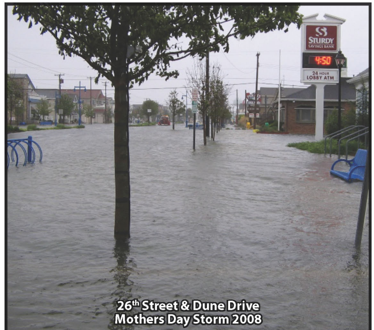
26 th Street & Dune Drive Mothers Day Storm 2008